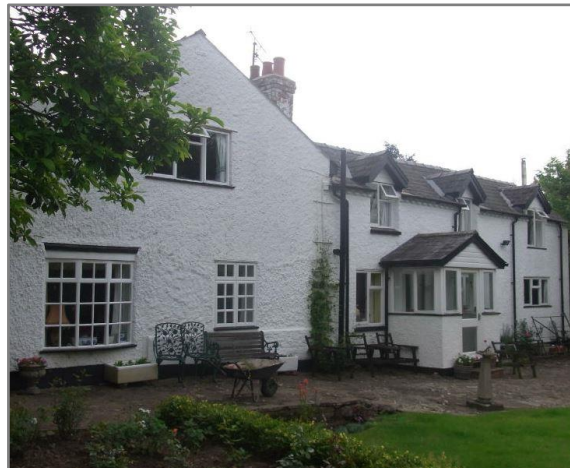
"Sunnyside" today (June 2016)