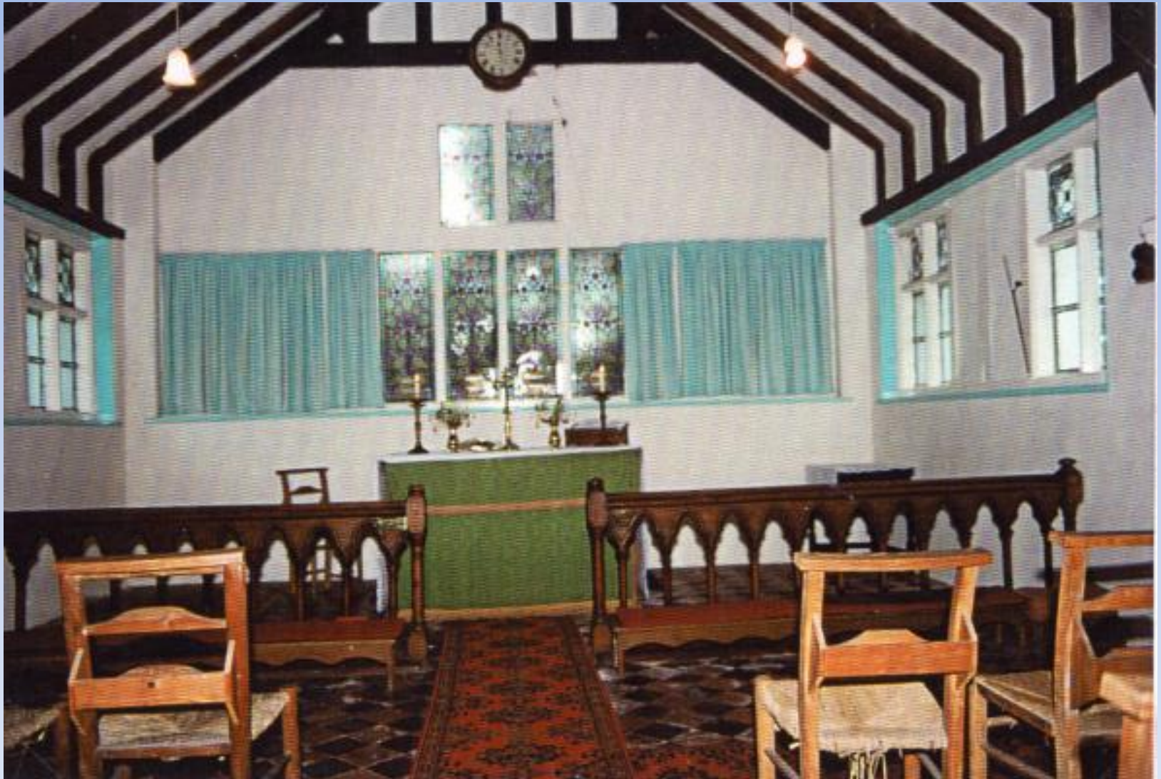
Looking towards the south end of the Mission Church July 10 th 1990