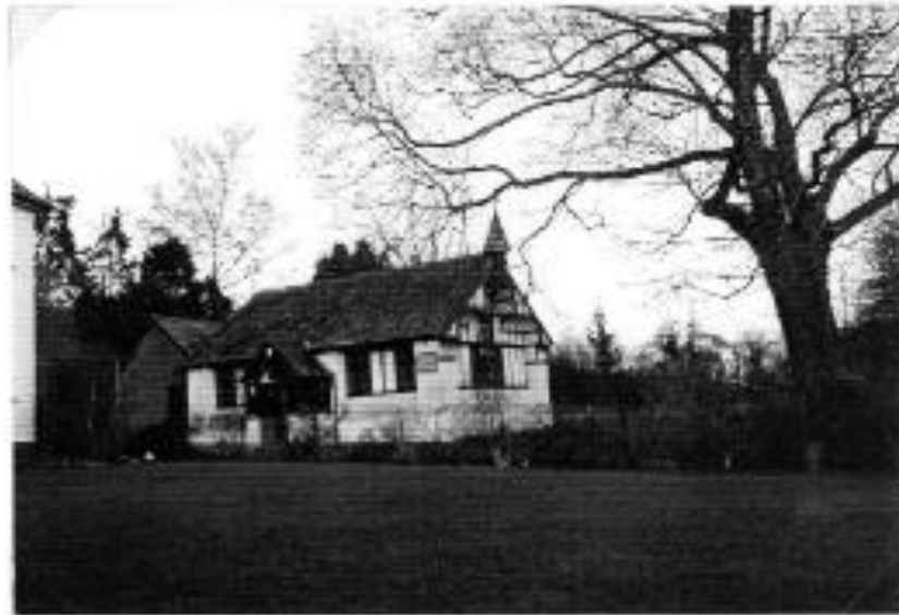
Breinton Mission Church, the photograph is taken from the road in January 24th 1990.