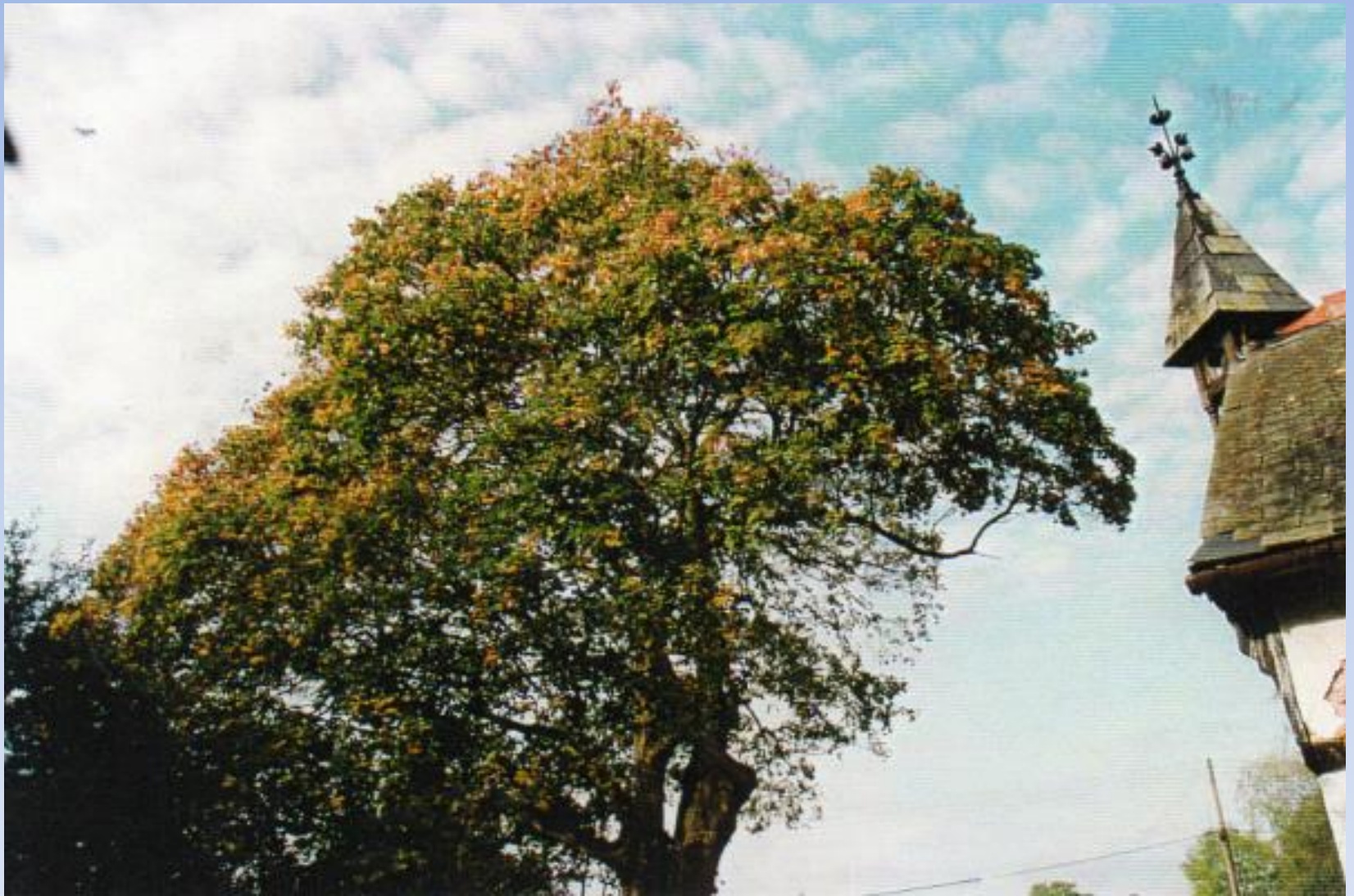
Mission Church in the sun! Autumn 1989 (?)