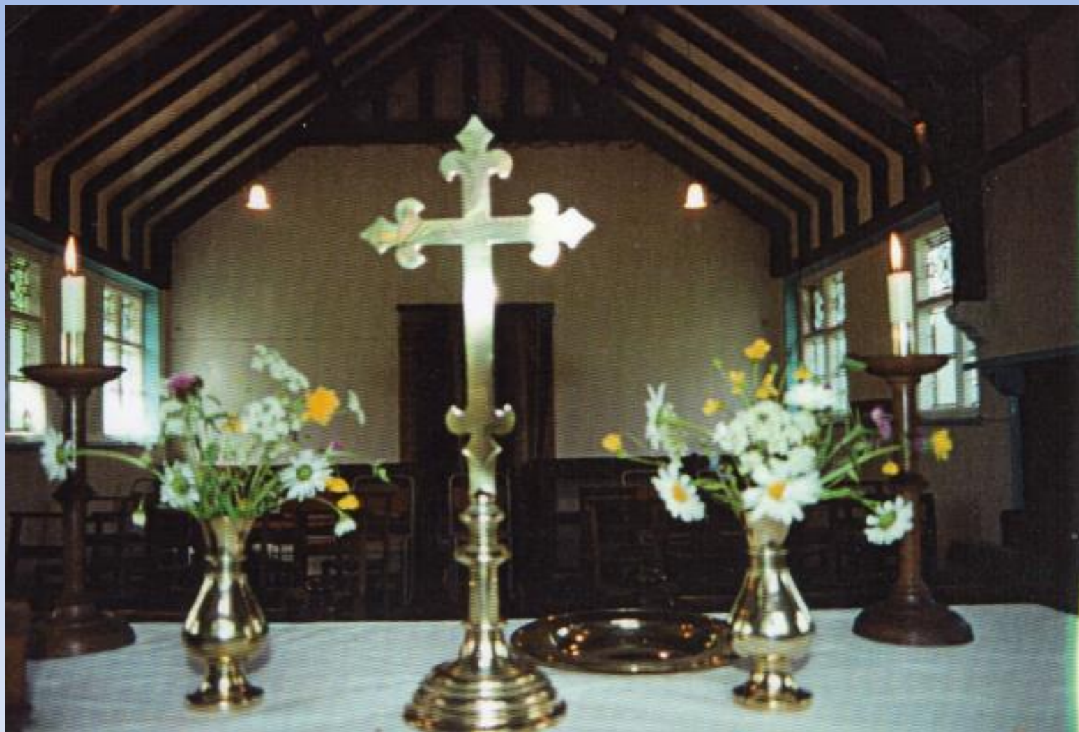
Behind the altar facing north . The doorway at the back leading to the Mission Room where the altar once stood pre-1956