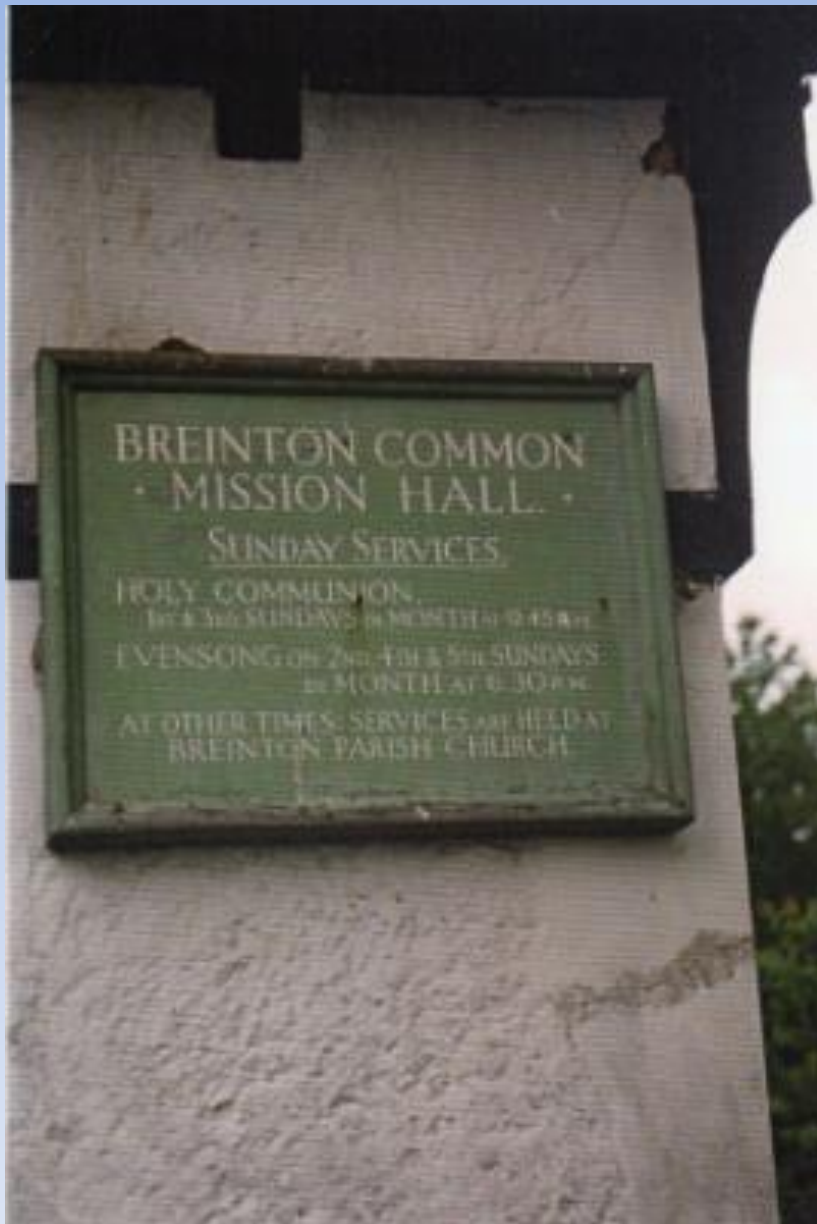
The notice board on the west side of the Mission Church