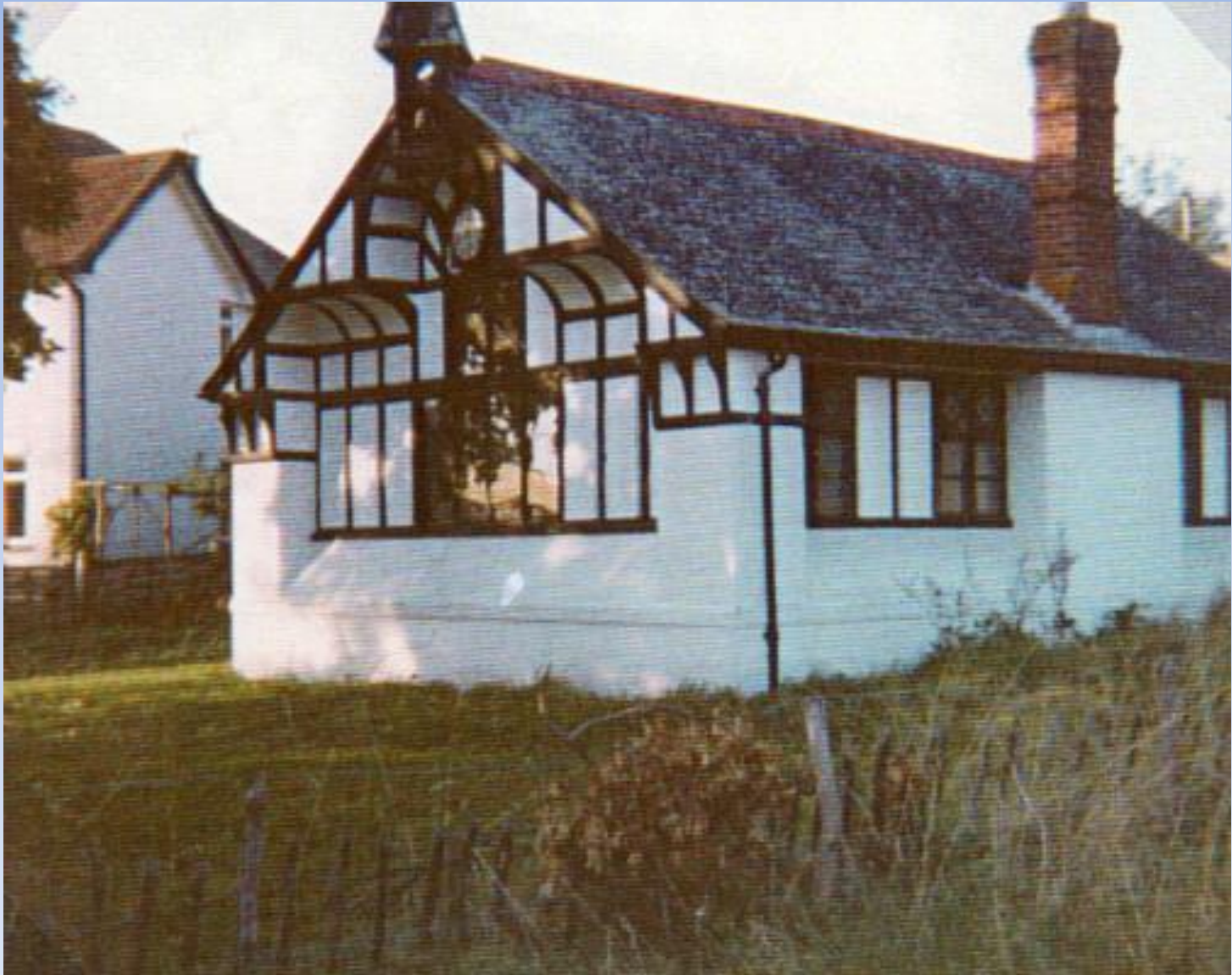
The south and east side of the Mission Church, Breinton Common 1977